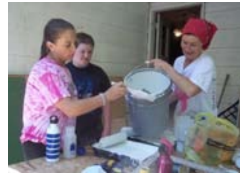
Young people want to return to Appalachia