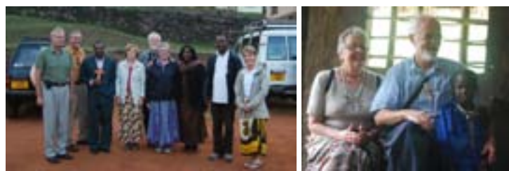
A team of six members traveled to Tansania and met our partner congregation in Pangani