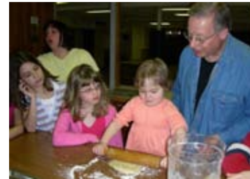
Holiday Food Boxes