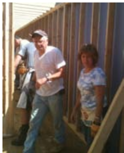
We help build a habitat home in Chester