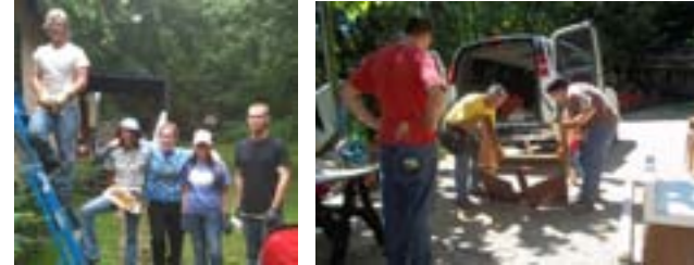
Two teams of youth and advisors traveled to KY to repair homes for the Appalachia Service Project